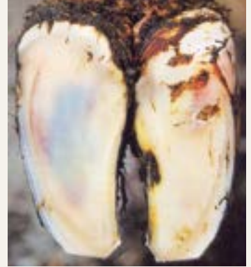
Blueish or yellow-red colourings are typical signs of sub-clinical laminitis.